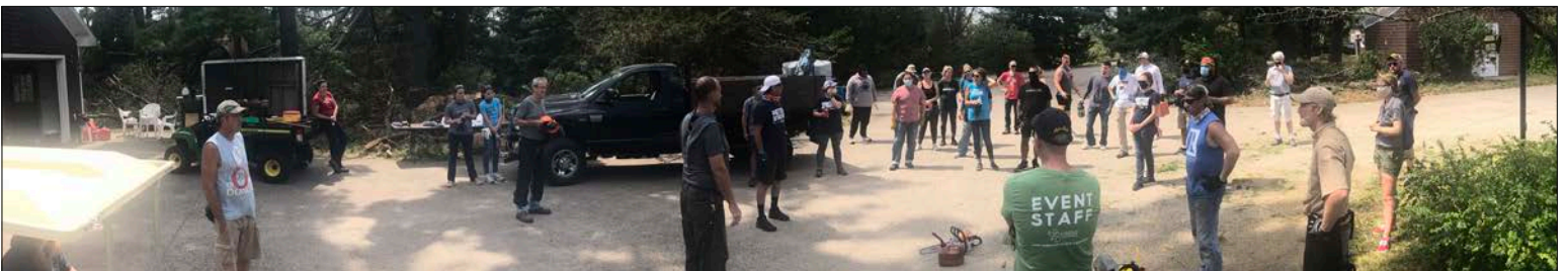
A group of 30 volunteers coordinated by the Cedar Rapids Metro Economic Alliance and Iowa City Chamber of Commerce, including University of Iowa football and women's basketball players, listening to instructions for volunteering with derecho clean-up efforts one week after the derecho.