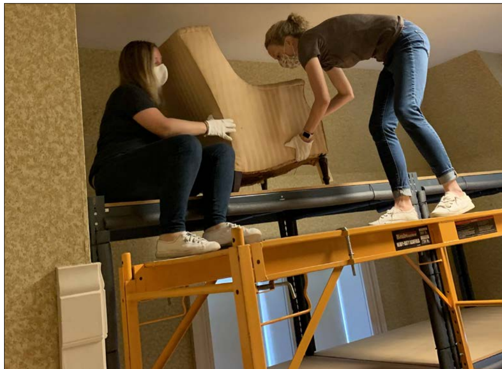
Right: Staff returned furniture to the collections storage room on the third floor after the window work in that space was completed in November 2020.

Phase I of a site-wide infrastructure update began in April 2020 and was mostly complete in August before the derecho. The replacement of the electrical backbone across the property created a consistent framework. The installation of lights on each building, bollard lights on footpaths, and roadway lights along the driveway increased safety. Designated service locations increased power availability in key event spaces while improving ease of use. Planning is underway on the next phase of the infrastructure upgrade to replace the HVAC system at the mansion.