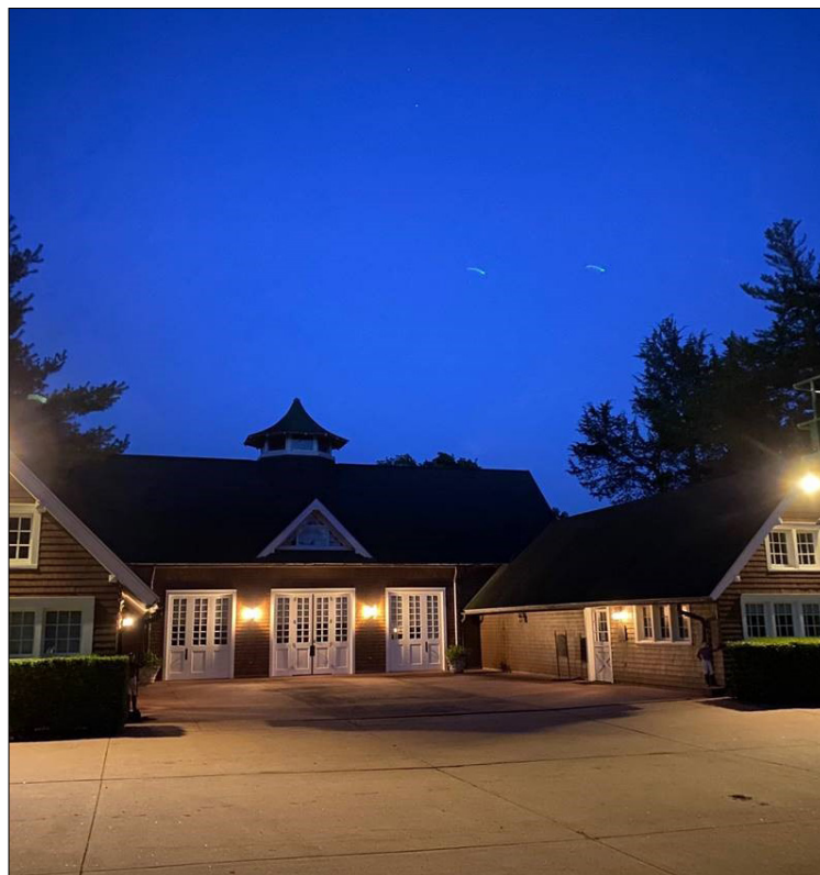
New lights were installed on the buildings to improve security and visibility.