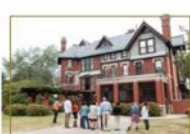
Hours & Admission