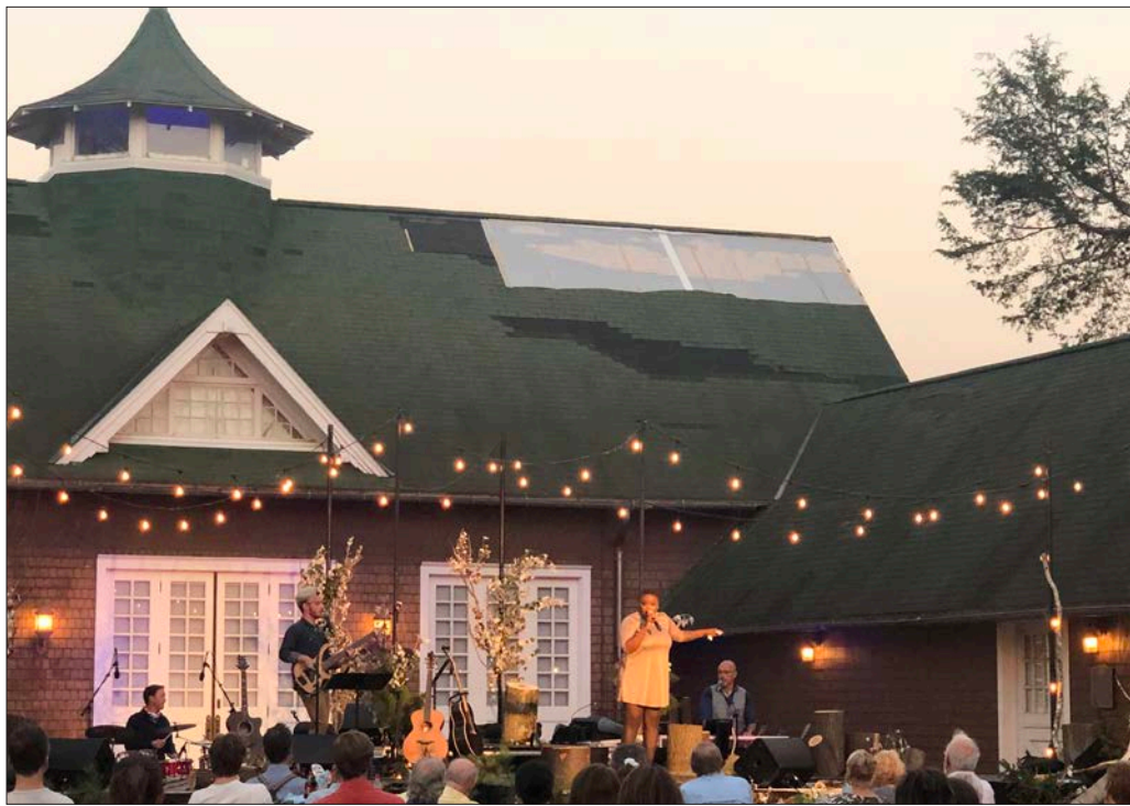
Music in the Courtyard opened two weeks after the derecho while recovery efforts were underway.