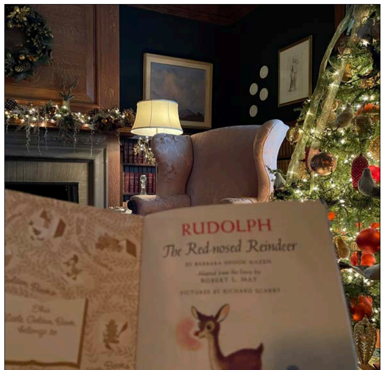
Guests enjoyed self-guided holiday tours featuring interactive experiences.