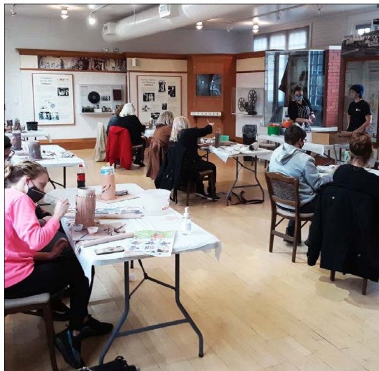
The Iowa Ceramics Center leading a luminaire workshop in the Visitor Center.