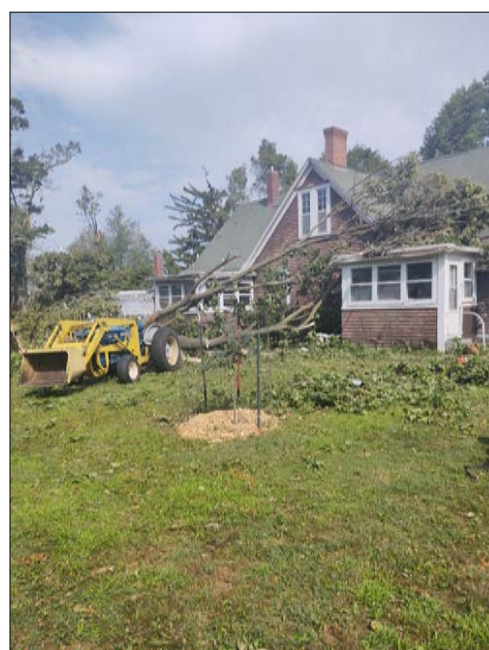
Top: The 1915 Lord & Burnham Greenhouse shown after the removal of a large oak tree that had fallen on the glass house.