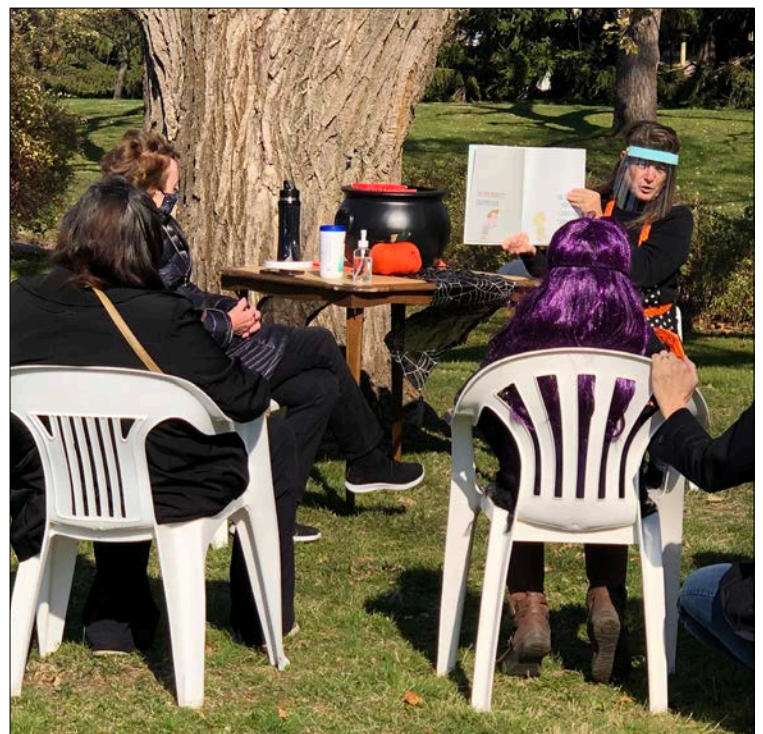
Families enjoyed A Halloween Adventure featuring outdoor activities in October.