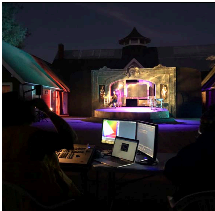
Brucemore partnered with Theatre Cedar Rapids for outdoor theater in October.