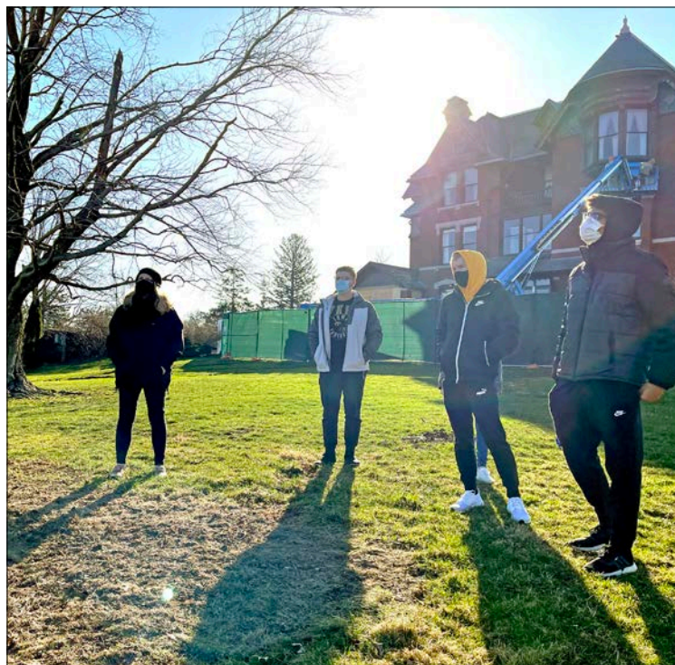
Iowa Big students developed a plan to help with recovery of the First Avenue lawn.