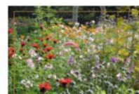
Directions & Parking