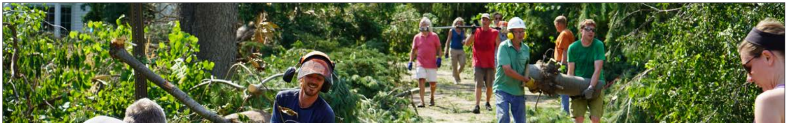
Brucemore staff and neighbors working to clear trees and debris from Dows Lane, a road adjacent to the estate, in the days following the August 10, 2020 derecho.