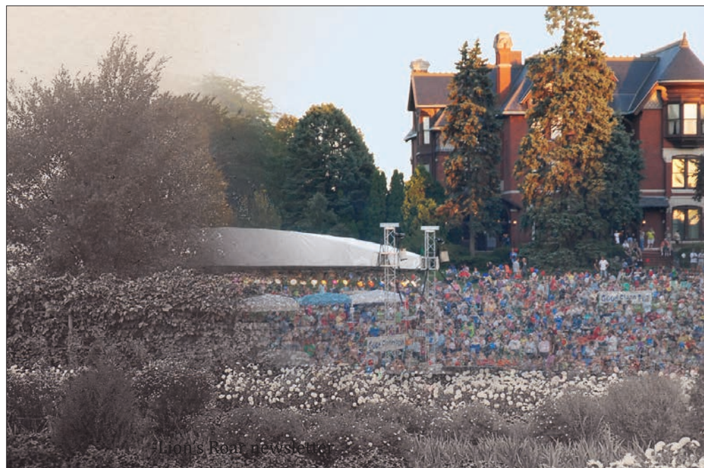
Lion's Roar newsletter

MISSION: To engage the public in the history, traditions, resources, and ongoing preservation of Brucemore for the enrichment of the community.