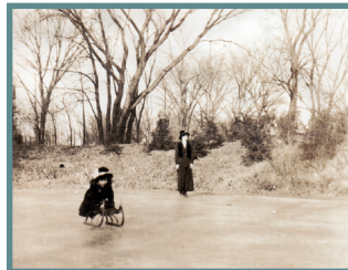
I am a place for boating, swimming, and ice-skating.