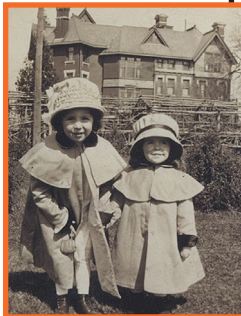
I am a family home that includes a nursery.