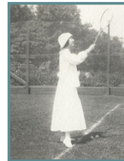
I was built for healthy outdoor activity.