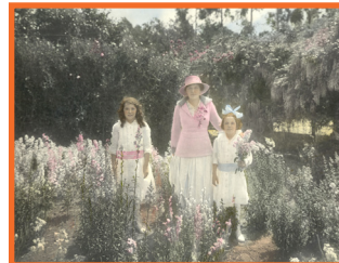
I am planted with many flowers.