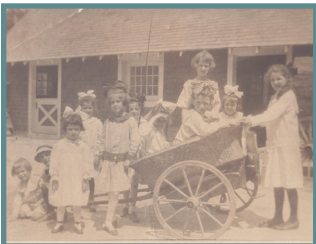
I am where horses lived and children played in the hay.