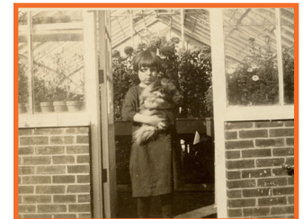
I am where flowers were grown to plant in the garden.