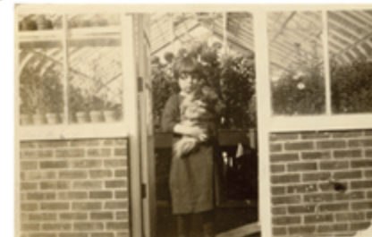
I am where flowers were grown to plant in the garden