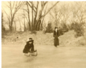
I am a place for boating, ice-skating, and swimming