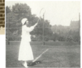
I was built as a place for healthy outdoor activity