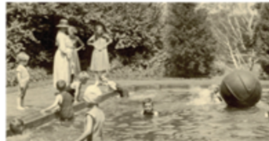
I was given to the girls instead of a party