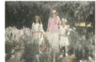
I was carefully planned and planted with many flowers