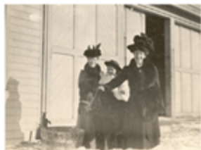
I am where horses lived and children played in the hay