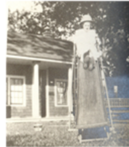
I was a playhouse with running water and a stove