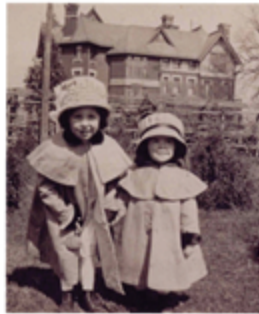
I was home to a total of 9 children

What was it like to grow up at Brucemore in the early 1900s? Match the pictures to their location on the map to see how the Douglas girls spent their time.