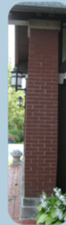
Tapered square Columns

Craftsman features are often bold and rustic looking. Can you spot the Craftsman style features on any of the outdoor porches?